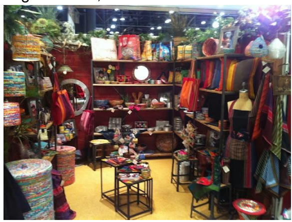
JeevanKala's Booth at Winter NYIGF

JeevanKala is currently being considered for membership to the Fair Trade Federation and will participate in the New York International Gift Fair, to be held at the Javitz Center in New York City from August 18-21, 2012.